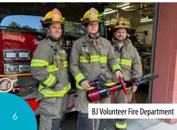
BJ Volunteer Fire Department