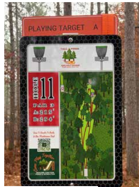
Tall Pines Disc Golf Course