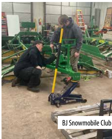
BJ Snowmobile Club