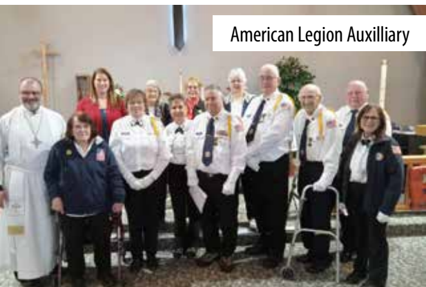
American Legion Auxilliary